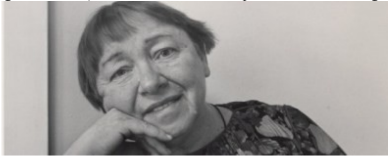
Marion Zimmer Bradley: World Fantasy Award Lifetime Achievement winning author, child-rape apologist and violent child molester.