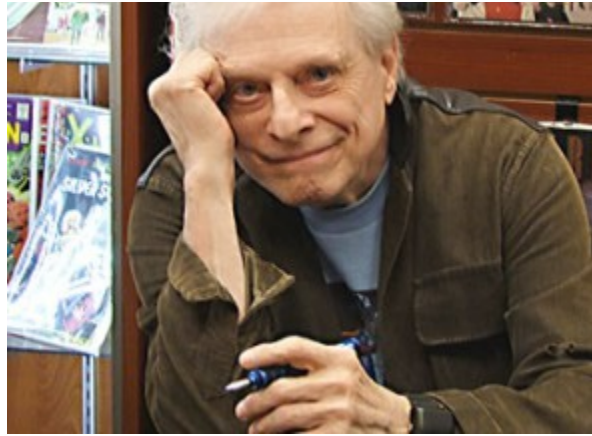
Harlan Ellison – Multiple Hugo, Nebula and Edgar-winning author, gadfly and defender of pedophiles.

Harlan Ellison – A large number of science fiction big names have gone on record to staunchly defend the rights of pedophiles, while the number of opponents of such a culture are not only small, but not prominent. One of the more popular voices in science fiction is Ellison, and he used his weight to lend support to the “Free Ed” movement, with no concern for the actual victims: