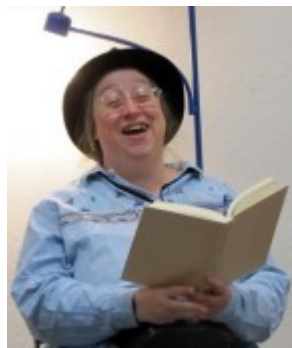
Jo Walton, Campbell and World Fantasy Award Winner

John W. Campbell and World Fantasy Award-winning Jo Walton wrote for Tor.com: "I could write a considered post about Delany's significance to the field, but I'm just too enthusiastic about his work to